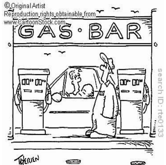
"Fill it up with last weeks gas... You know, the stuff that was ten cents cheaper."

Prices shooting up, but WPI inflation still in red. Annual inflation fell by 1.55% for week ended June 27