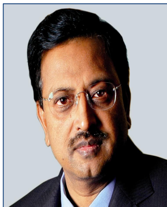
B Ramalinga Raju

The disgraced founder of Satyam Computer Services